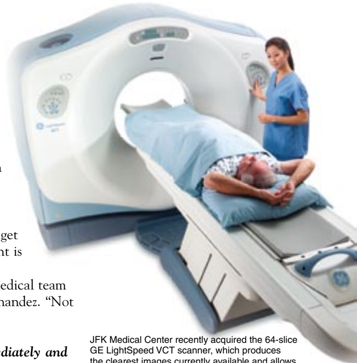
JFK Medical Center recently acquired the 64-slice GE LightSpeed VCT scanner, which produces the clearest images currently available and allows physicians to diagnose cardiac problems faster and with less-invasive methods.